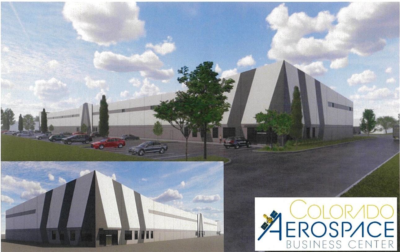
Perspective Images – Colorado Aerospace Business Center Phase 1 Building