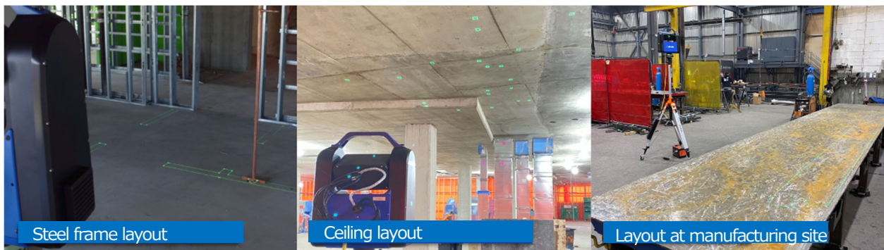
Photos: Marking on floors and ceilings and use case at manufacturing site

Mechasys is currently working to develop a mass-production model and build a production system, with a target launch in 2024. To solve problems in the construction industry in Japan, Great Wave Ventures, Toda Corporation, Tokyu Construction, and Ogawa-Denki, a subsidiary of the Ogawa Group, will support the development of the mass-production model of Mechasys in cooperation with construction companies and construction equipment sales and leasing companies in Japan.